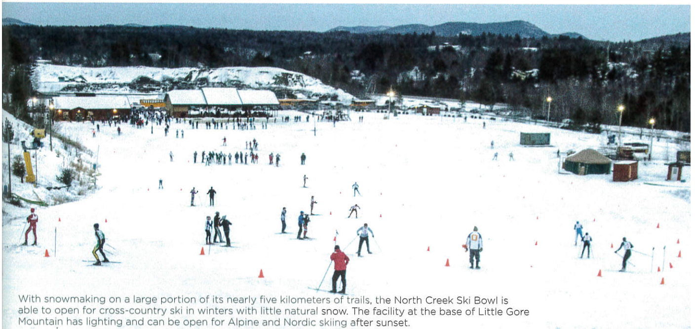
With snowmaking on a large portion of its nearly five kilometers of trails, the North Creek Ski Bowl is able to open for cross-country ski in winters with little natural snow. The facility at the base of Little Gore Mountain has lighting and can be open for Alpine and Nordic skiing after sunset.

SNOW TRAINS TO THE SKI BOWL This season, the Ski Bowl is scheduled to be the site of many Section II events at its championships, more NYSSRA races and two Junior National qualifiers. It is part of the evolution of the Ski Bowl, which traces its roots to the arrival of the first snow train on March 4, 1935.