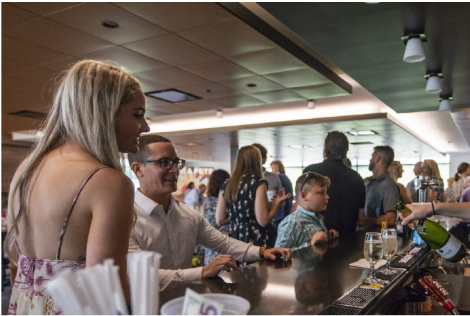
Reception in The Tannery Banquet Hall