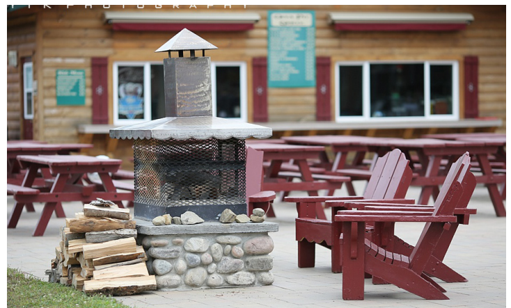
Chiminea on the Outdoor Patio