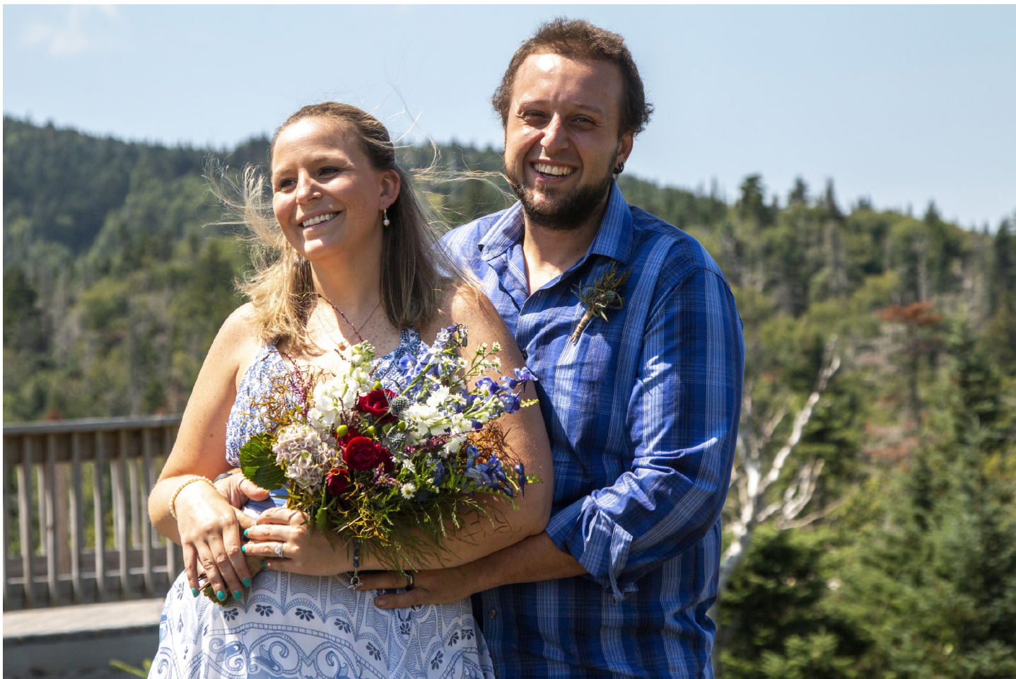
Summer Elopement Ceremony