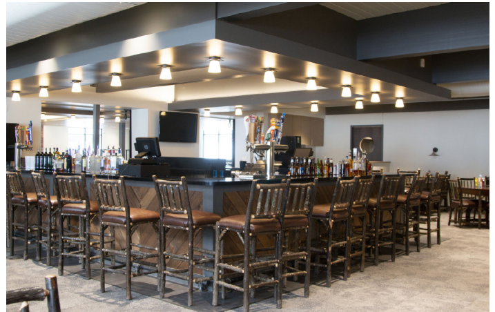
Bar area of The Tannery Banquet Hall