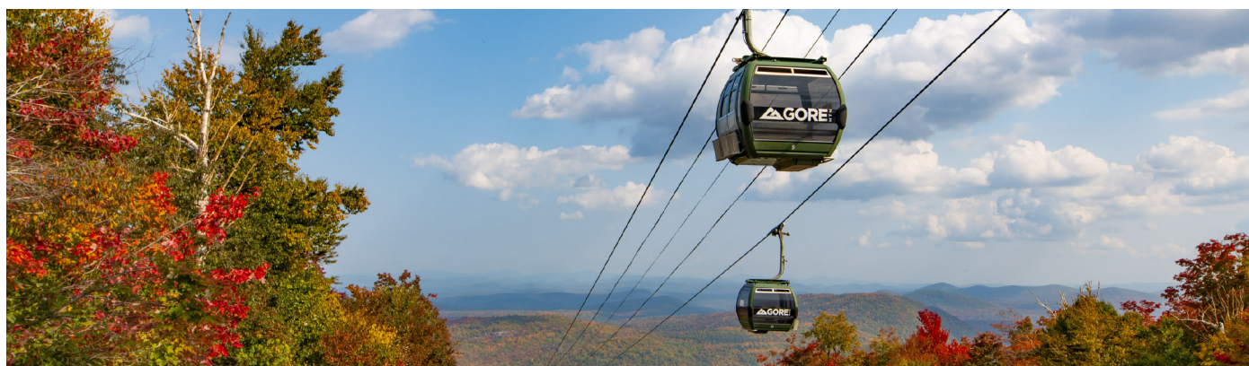
The Northwoods Gondola