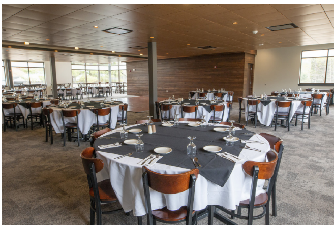
Indoor Round Top Seating

Sit and soak up the warmth at the end of a festive evening.