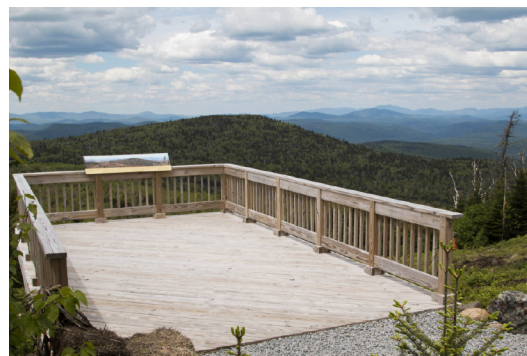
The Fairview Deck