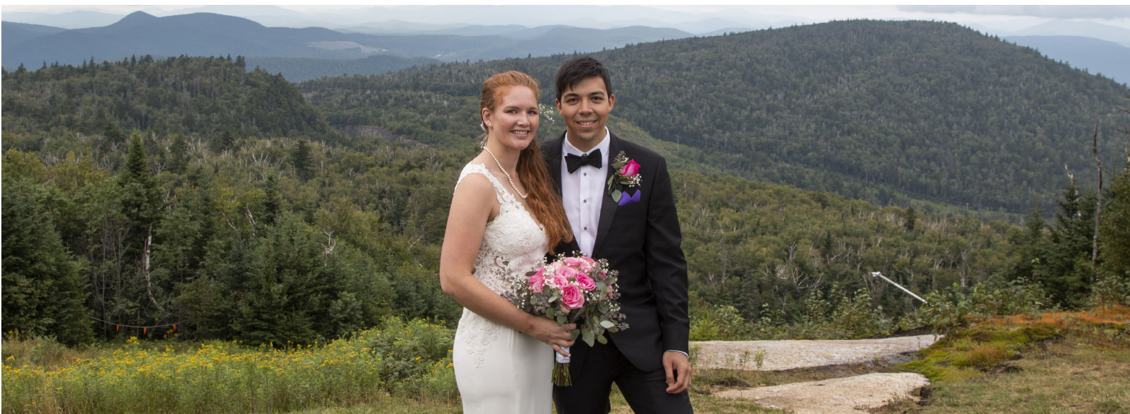
Couple Posing on top of Bear Mountain

Our wedding packages include taxes, service charges, and reception room rentals. Fees for an on-site ceremony, rehearsal dinner, or post-wedding breakfast are additional.