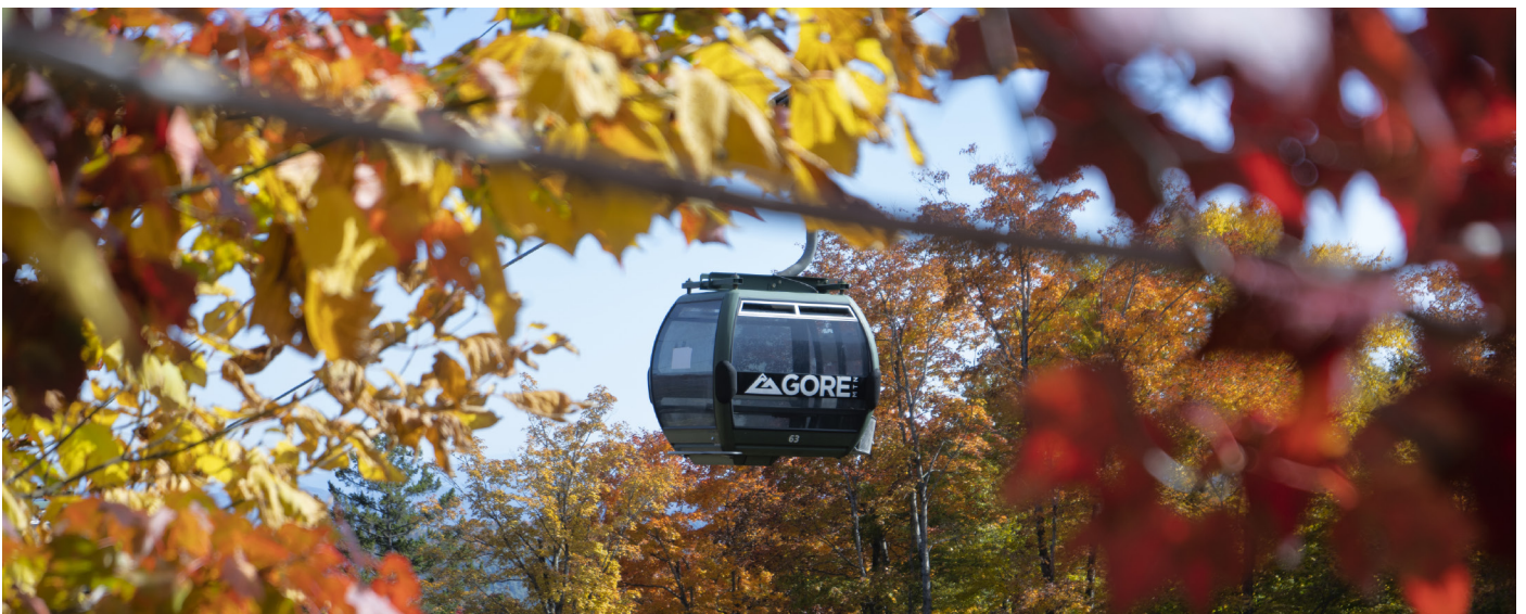
The Northwoods Gondola