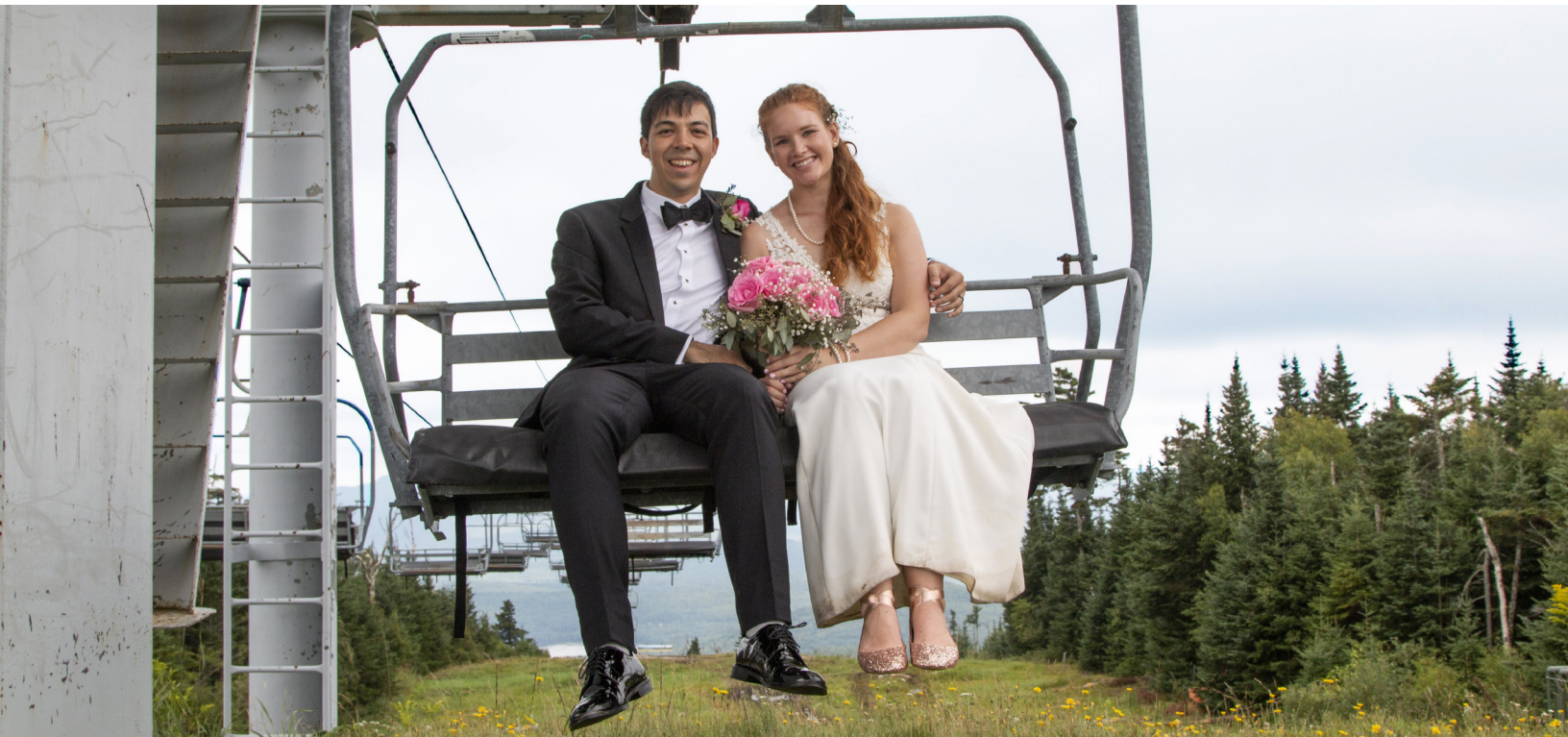
Fall Scenic Skyride