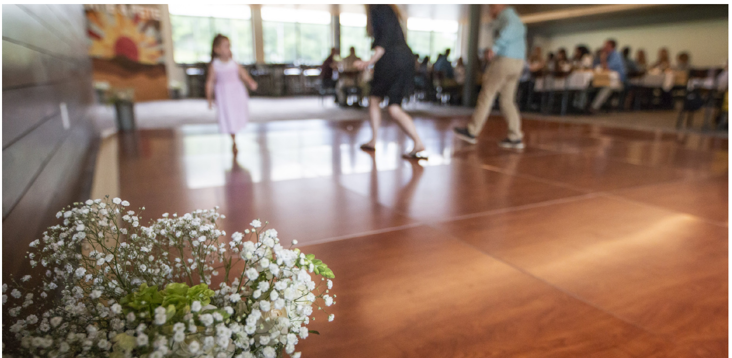
Indoor Dance Floor