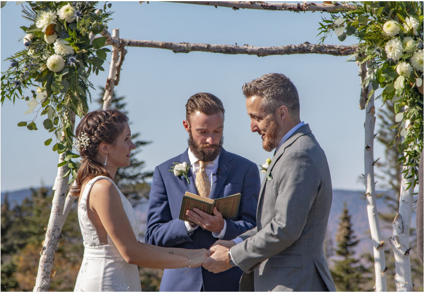
Fall Bear Mountain Ceremony