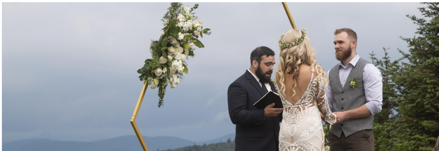
Couple Under the Golden Wedding Arch

Services not provided by the venue include but are not limited to: Linens, Day-Of Coordination, Entertainment, Florist/Decorator, Photographer/Videographer, and Officiant.