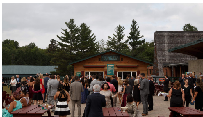
Receptions on the Lawn and Patio