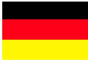
14. Fed. Rep. of Germany