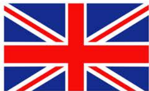
18. Great Britain