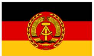
17. Dem. Rep. of Germany