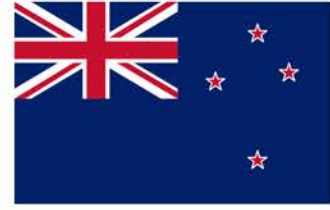
28. New Zealand